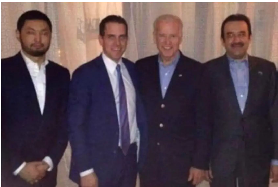
Figure 8 (From left to right) Kenes Rakishev, Hunter Biden, Vice President Biden, and Karim Massimov.