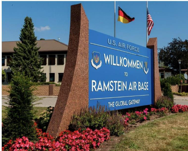
A sign welcomes visitors to Ramstein Air Base, Germany.

[Editor's note: this story was update late Friday with the Air Force's response.]