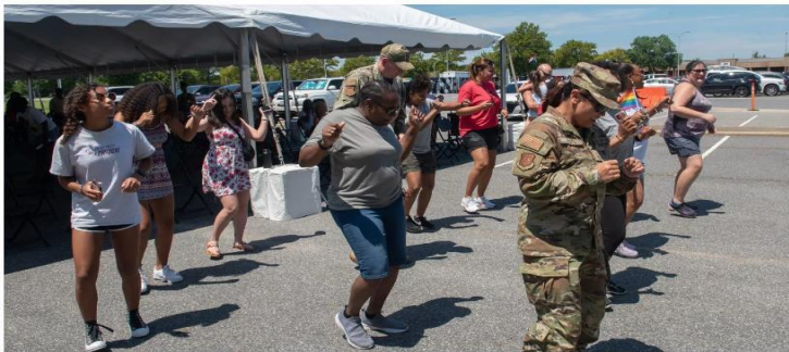
Breaking Barriers Alliance of Joint Base Langley-Eustis put on the Diversity, Equity & Inclusion Summer Festival on July 30, 2022.

Air Force hosts drag show at kid-friendly ‘diversity, inclusion’ festival on base